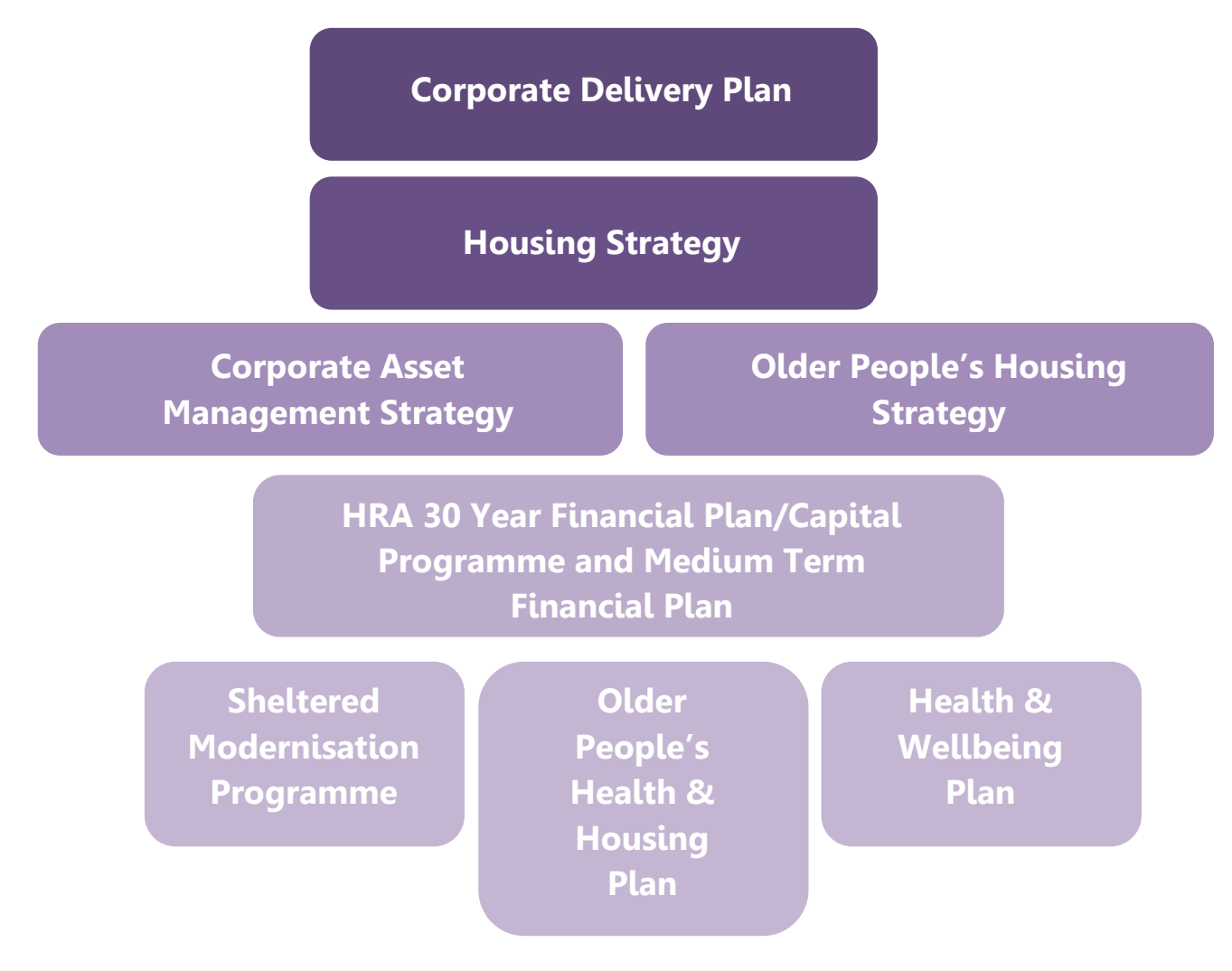
Diagram 2.1 Link to wider corporate context

investment strategy through the sheltered modernisation programme and the effect this will have on our assets. The diagram below reflects how the Strategy fits within the wider corporate context.