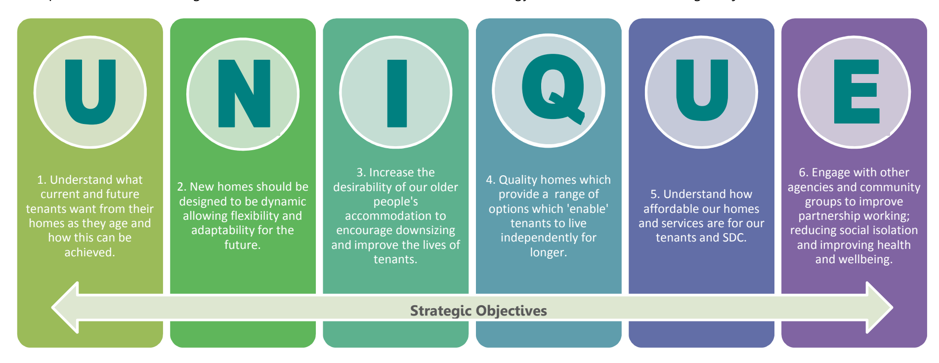
Diagram 6.1 Strategic Objectives

In response to these challenges, and to achieve the Council's vision, this Strategy seeks to deliver six strategic objectives: